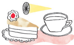
Coffee and Cake

We welcome you and your guests with a selection of alcoholic and non-alcoholic beverages – outside if the weather is nice. The highball of your choice will be served until dinner is served.